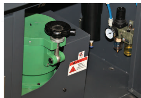
Sealed glue pot to reduce waste